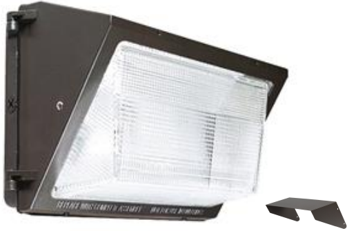
Glare Shield (GS)

Prismatic glass lens makes the most of the LEDs to widely distribute the highly efficient LED outs.